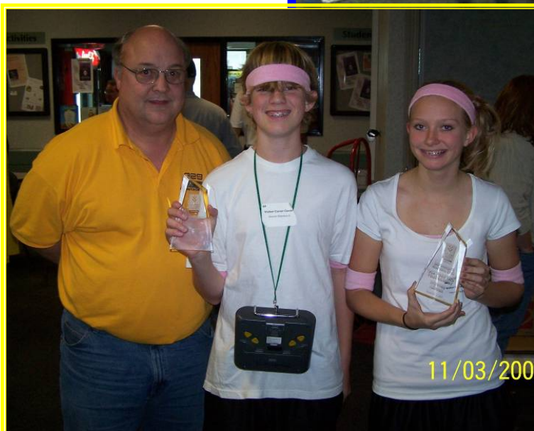
Walker Career Center Team (pictured at left) wins 1st Place in Robotic Competition in Bloomington.